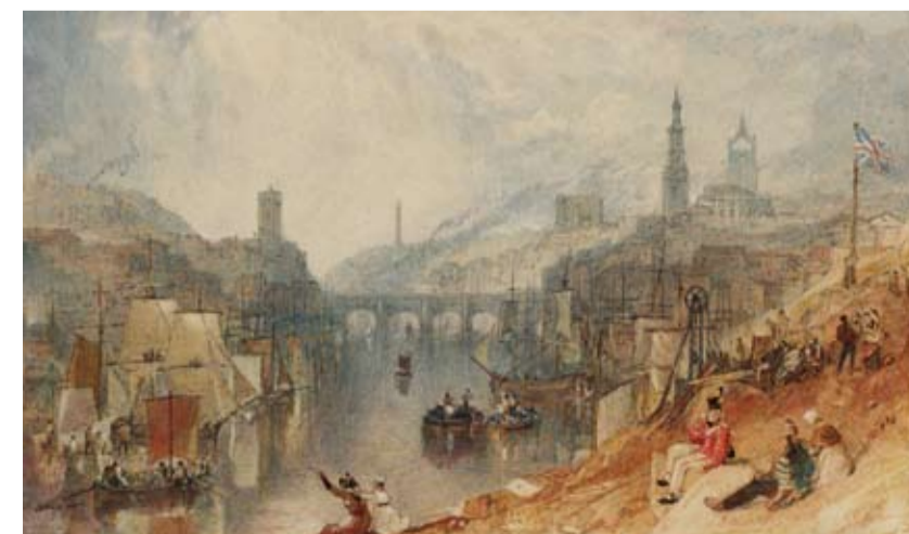
Newcastle-on-Tyne around 1823 by Joseph Mallord William Turner (1775 – 1851) on loan to Shipley Art Gallery by Tate, London.

From 1980 onwards "Urban Regeneration" was king transforming Newcastle and Gateshead once again with art and culture acting as the catalyst. Join the guided tour on Sunday 11 October (spaces limited) or download the route to complete on your own. Visit www.reinventingthecity.org.uk to download or book via the Lit & Phil direct.