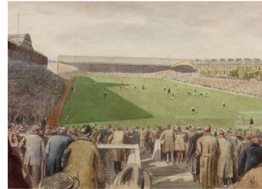
Above: St James Park Football Ground, Newcastle upon Tyne, about 1930-1939